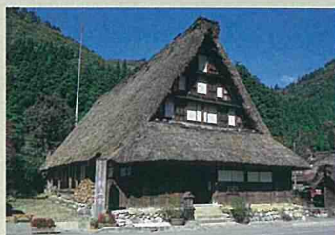
Murakami Family House (National Important Cultural Asset)

This typical village house of a historical architectural style has been preserved in Gokayama.