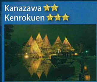
Kanazawa ★★ Kenrokuen ★★★